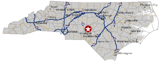
State Map of Hancock Meadow Branch